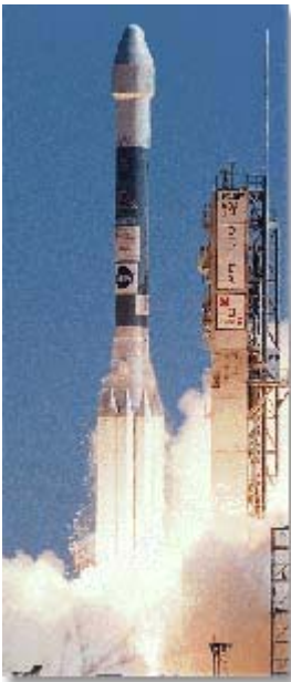
Delta rocket similar to the one that launched the Deep Space 1 spacecraft from Cape Canaveral, Florida, in October 1998.

Real rockets work kind of the same way. But instead of using tablets that fizz in water, they use rocket fuel.